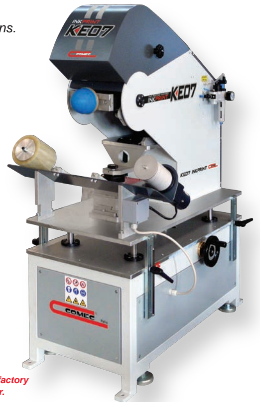
KE07 - 1 color Shown with optional factory stand and pad cleaner.