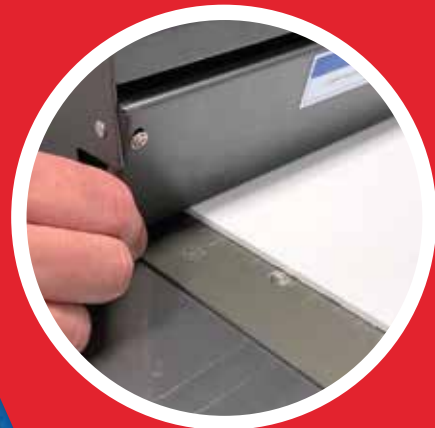
Crashbar protects printheads from damage