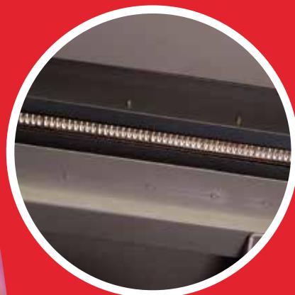
Inline, water-cooled LED curing lamps