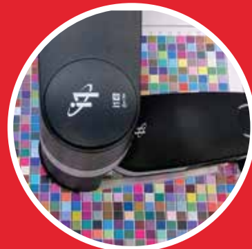
Three built-in custom color pre-sets